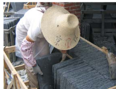
Every Slate Checked and Graded by Hand.