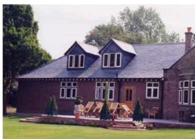
Only Grade 1. Quality Slates Supplied.